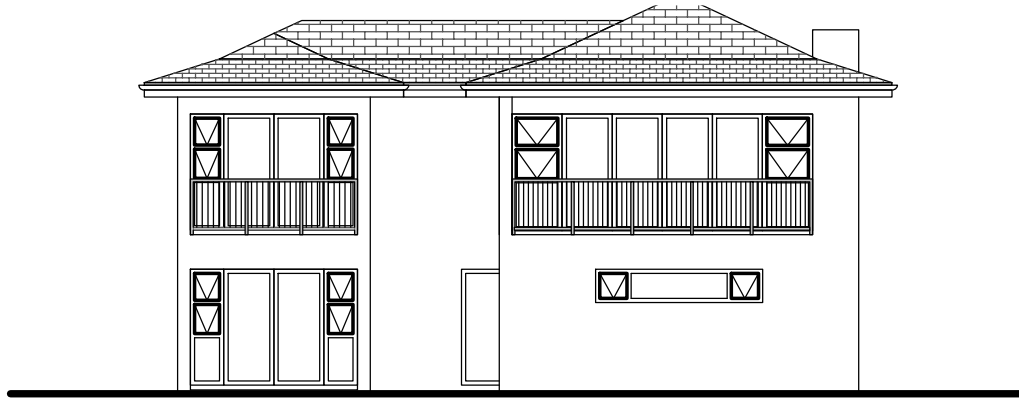
SEA FACING ELEVATION